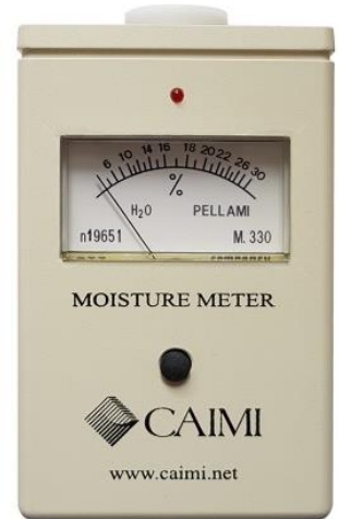
Analogic Moisture Meter